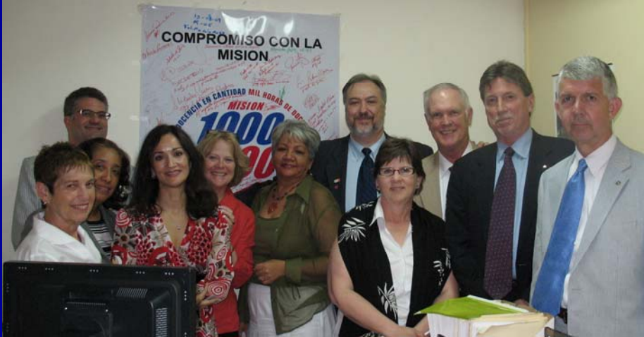
Above: Members of the Civitas International Delegation representing the Dominican Republic, Oklahoma, Colorado, and Michigan, March 2009 at the Dominican Republic

February 4-10, 2010 Oklahoma will host the first group of Dominican Republic Civitas Exchange Delegates.